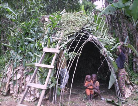
Baka children in our village

In that village, I continued to make a point of communicating with them. At the beginning of arrive, all of my saying was hello, but I could hold a conversation in Baka language a little bit after that. We can say that the experience of the class can support our research.