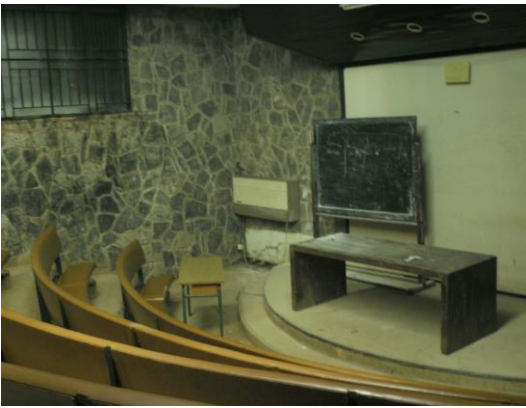
A class room in Yaoundé University 1